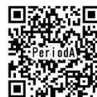
Period A Forms

[Period B] https://forms.office.com/r/kbBGzq9BUx