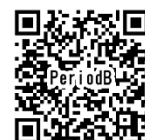
Period B Forms