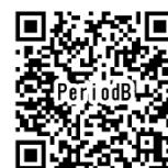
Period B Forms